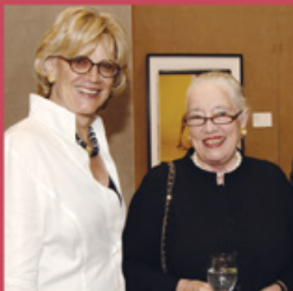
Participants at NewStart, the first auction of contemporary art to benefit Odyssey House, held at Sotheby's, June 2005; and one of the handmade masks created by members of the Odyssey House Art Project, also exhibited at the auction.