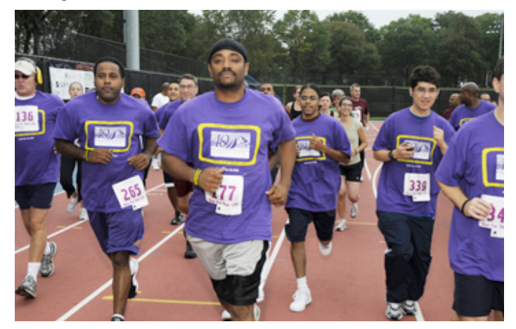
The runners get off to a fast start.

At Odyssey House, nothing says 'celebrating recovery' better than families getting together to support loved ones who, through hard work and commitment, have changed their lives. And on a Sunday morning in late September, hundreds of men, women and children turned out to show just how much they value recovery and the organizations that support it.