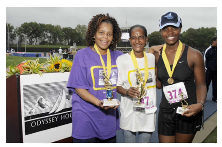
Top female runners proudly display their trophies.