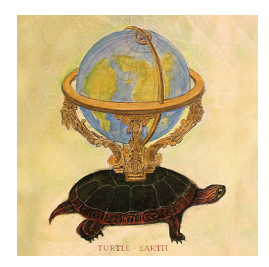
The Odyssey House Art Project is preparing for its next exhibition on spirit animals.

Visit our blog for more news and updates from Odyssey House!