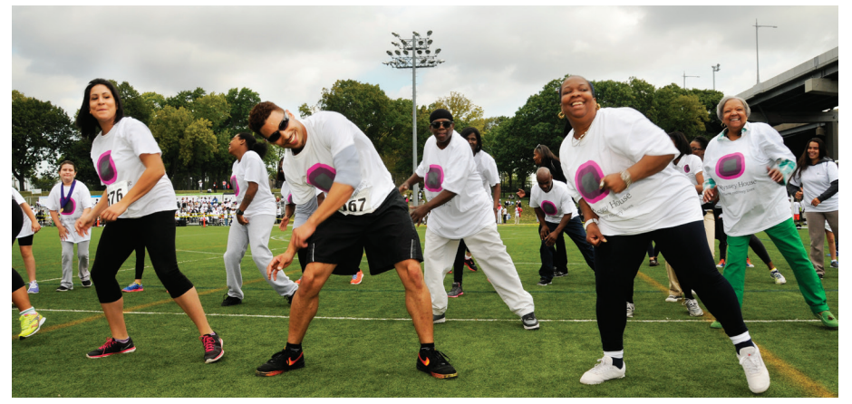
Fun activities like Zumba lessons and yoga demonstrations kept the participants active throughout the day.